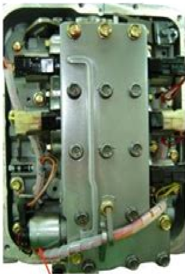
Variable force solenoid