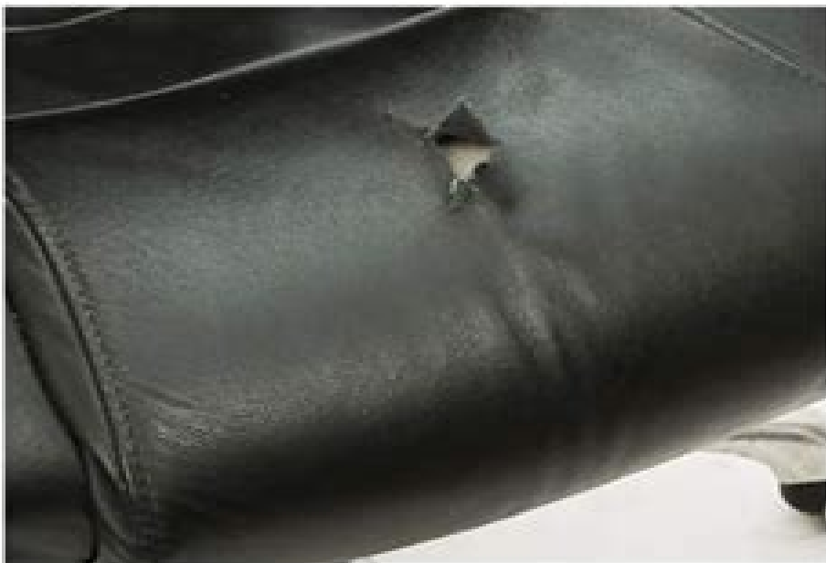
Select the parts to be repaired