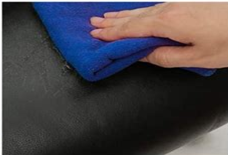
Wipe the repaired parts clean