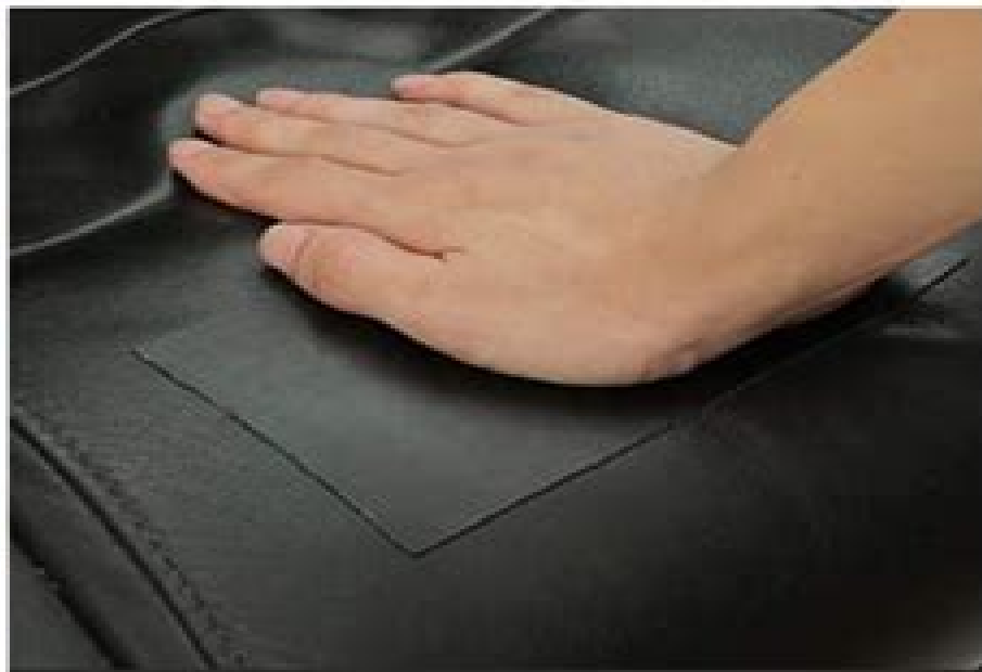
Press firmly to complete the repair