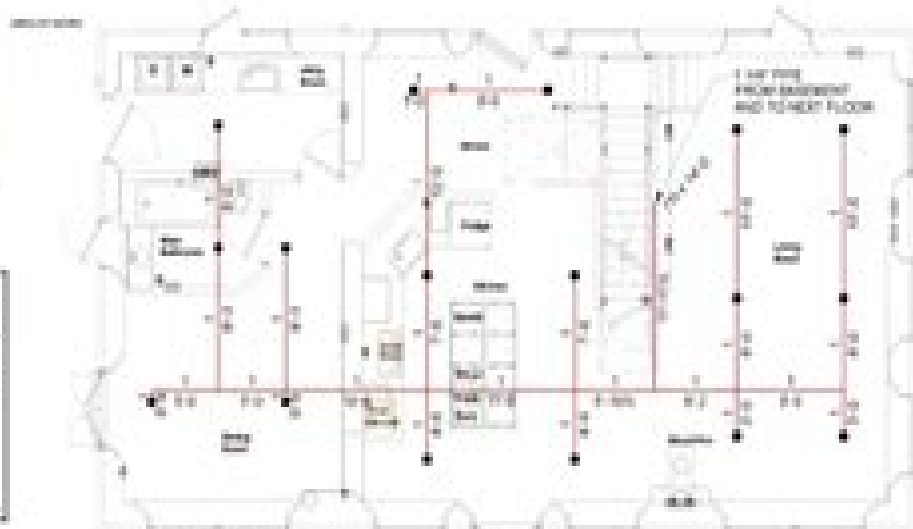
MAIN FLOOR PLAN SCALE: 1/8" = 1'-0"