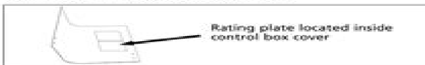
Rating plate located inside control box cover

Locate rating plate on unit corner panel. It contains information needed to properly install unit. Check rating plate to be sure unit matches job specification.