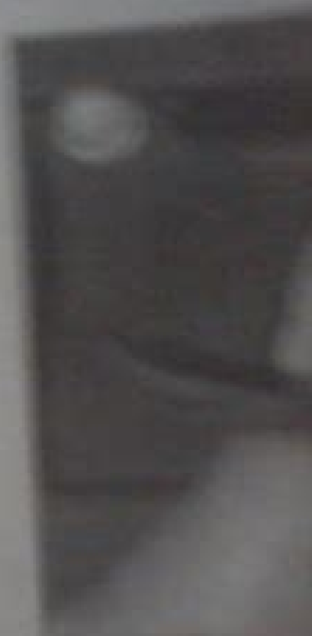
7.18 To die connector from the locking tab tab (200

to the left (driver's side) of the cylinder head. Two illustrations: On 1988 through 1997