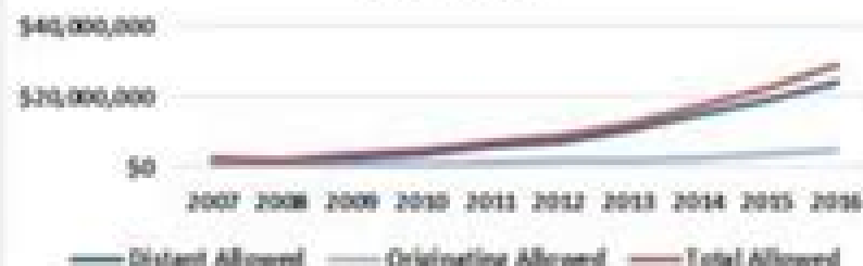
Medicare Claims Filed for Telehealth Services