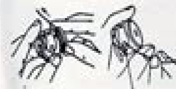
Abertura da fenda

*Puxe a linha para a esquerda, por baixo da mola de tensão, até que entre na abertura da saída.