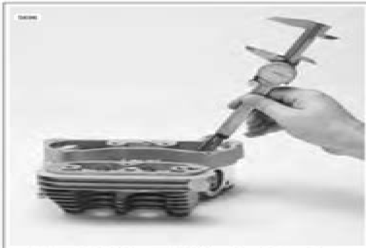
Figure 3-55. Measuring Valve Stem Protrusion