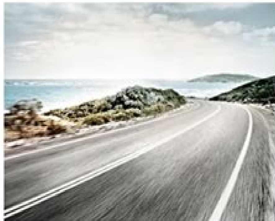
Golf, Golf GTI Owner's Manual

Owner's Manual Golf, Golf GTI U.S. Edition, Model Year 2021 Publication: 08-04-2020 English (USA) 2020-04 Title No.: 92M000120007