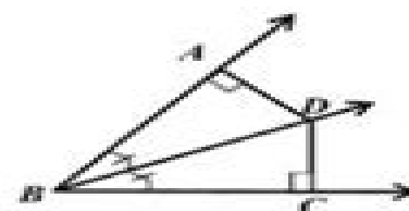
Use this figure for 10 - 13

In problems 14 - 16 use the diagram shown to find each measurement requested.