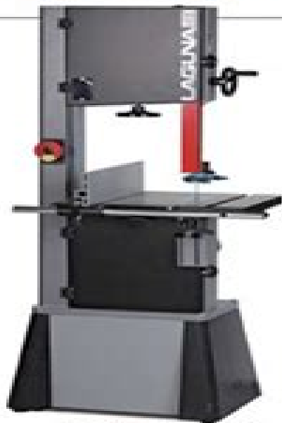
14-in. Bandsaws, p. 66