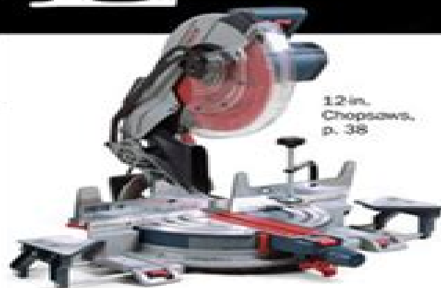
12-in. Chopsaws, p. 38