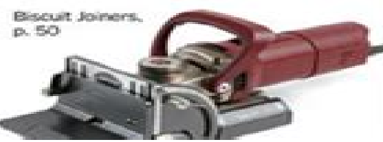
Biscuit Joiners, p. 50