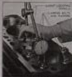
FIG. 5. POLYMERIZATION OF 2-METHYL-2-BUTENE