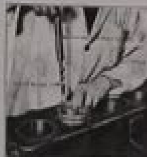
PUL. 10. Formed a figure fully open prior before meeting with