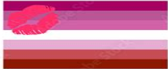
Lipstick lesbian flag