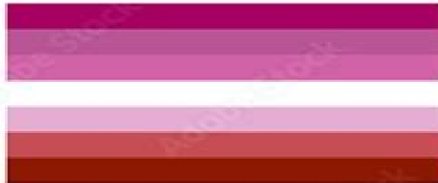
Pink lesbian flag