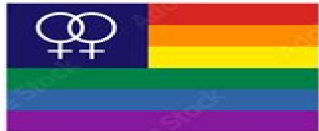
Lesbian pride flag variant