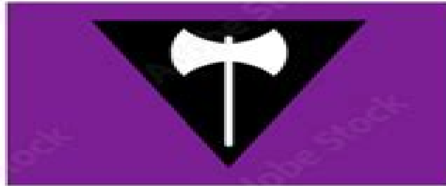
Labrys lesbian flag