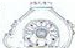
Ford 14, 209, 302, 251C, 251F