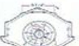
GM TH-400, 350, 250-48, 700R4, 3.80, 4.10, 4.62R Chevrolet