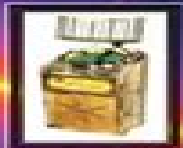
1962 AMI Continental

PRICE & IDENTIFICATION GUIDE CURRENT VALUE & PHOTOS OF OVER 700 JUKEBOXES, WALLBOXES & SPEAKERS FROM 1920-1990's