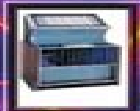
1972 Rockola 449