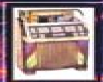
1932 Seeburg M100C