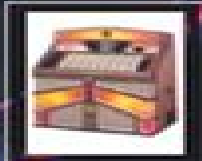
1968 Rowe R92