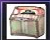
1956 Wurlitzer 2000