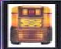
1941 Rockola Master