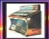
1941 Seeburg AT160