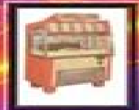
1955 AMI G129