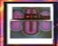
1977 Seeburg STD4