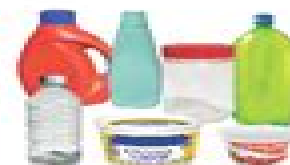
Plastic Kitchen, Laundry & Bath Containers (empty, with cap on)