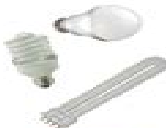
Bulbs, Lamps, & Ballasts