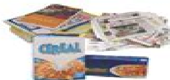
Mixed Paper, Newspaper, Magazines, & Unwanted Mail