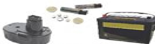
Batteries (tape terminal ends)