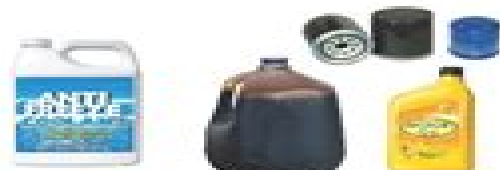
Antifreeze, Used Oil, & Oil Filters (2.5 gallon containers or smaller, no rags or debris)

Fees are associated with some of these materials to cover the cost of proper disposal.