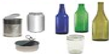
Aluminum & Steel Cans, Glass Bottles & Jars (empty & rinsed, labels can stay on)