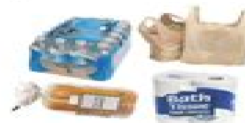
Plastic Film & Bags