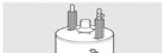
Typical vertical piping arrangement

For increased energy efficiency, some water heaters have been supplied with two 24" sections of pipe insulation.