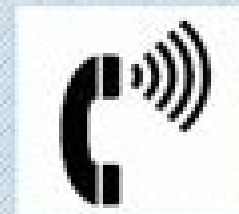
Volume control telephone