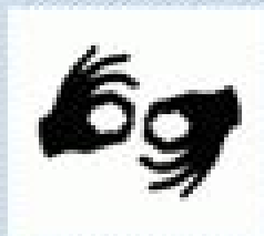
Sign language interpretation provided