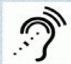
Assistive listening devices