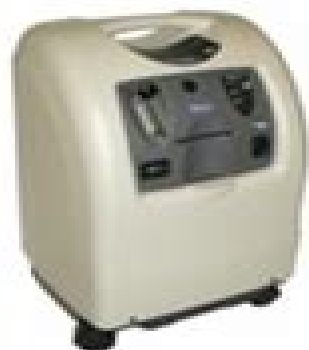
Perfecto 2 Concentrator