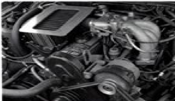
Turbo charged SVO powerplant

PAH PUBLISHING International 711 Hillcrest St. Monett, MO 65708 www.pahpub.com