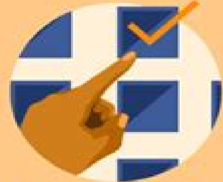
3. Gut instincts