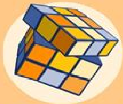
1. Trial and error