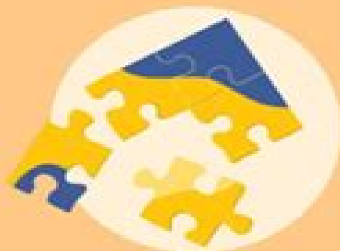
4. Working backwards