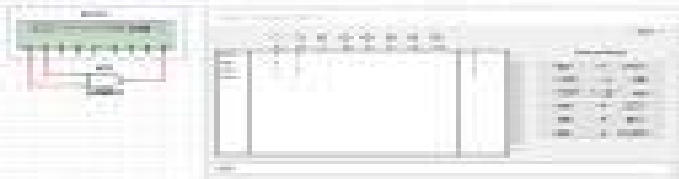
Figure 3-1 shows a block set library browser. The block set library browser is used to select the blocks to be used in the simulation. It is used by dragging the blocks from the library browser to the simulation diagram. The blocks are organized into categories, and the user can search for blocks by name or by function. The blocks are organized into categories, and the user can search for blocks by name or by function.