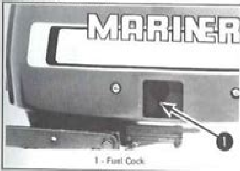
Fig. 8. Fuel Cock (Model 2)

Loosen the air screw (located on the fuel tank cap) two turns, to allow air into the fuel tank.