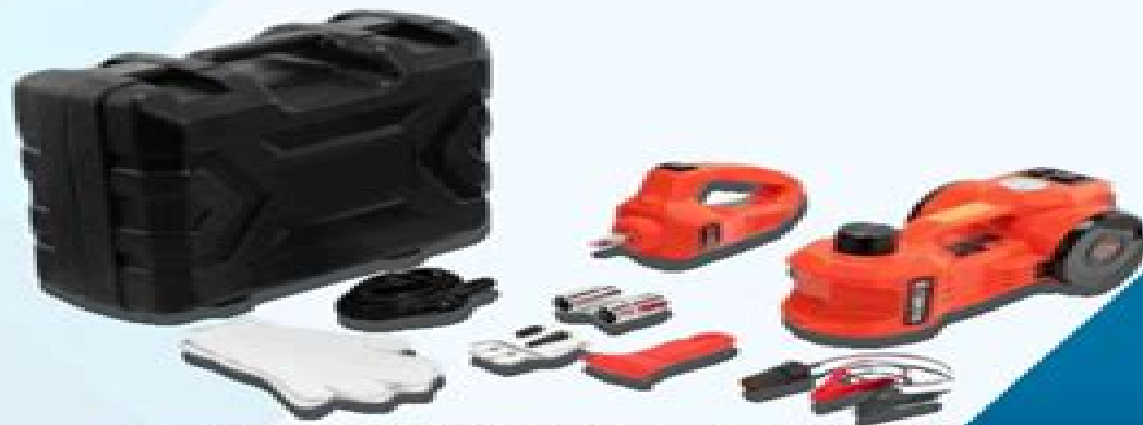
Electric jack | Inflator Pump | Electric Impact Wrench

Please read this manual carefully before operating and save it for future reference.