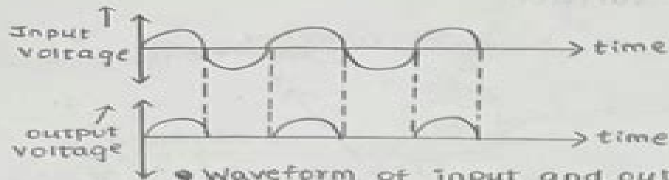
• Waveform of input and output signals for half wave rectifier.